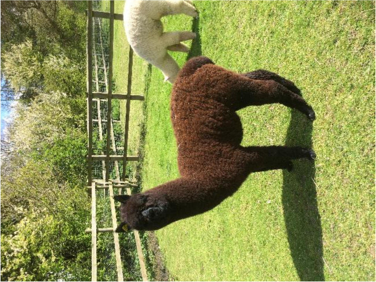
Mandinka Warrior at 1 year old